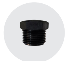
25mm Drain Bung

Disclaimer: The images shown are for illustration purposes only and may not be an exact representation of the product. Subject may vary based on model and or variant.