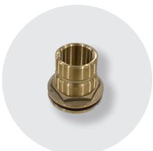
40mm Brass Inlet

Please note that fittings can be customised to your requirement.