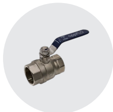
Brass Lever Ball Valve