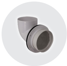
PVC Mesh Overflow