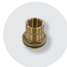
40mm Brass Outlet (for tap)