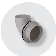
90mm PVC Mesh Overflow