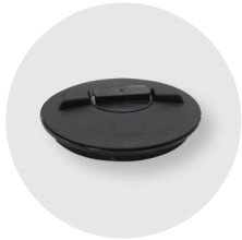
Screw on Lid