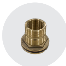
25mm Brass Outlet (for tap)