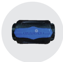
Poly Ball Valve